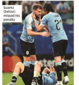
Suarez (below) missed his penalty

Uruguay had poured into Paris for the tournament but were to lose. We have won the Copa before but today we have to accept that we are out." Peru will face neighbours Chile in the last four, with tournament hosts Brazil meeting arch-rivals Argentina in the other semi-final.